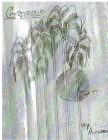
“The same moon shines for us all” Pencil drawing By Avinash (13 years)